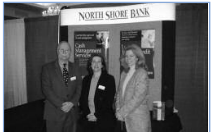
Shown above in the photo is Title Sponsor North Shore Bank's professional staff. Nearly 100 Exhibitors displayed their goods and services at this year's Expo. Businesses spanned the range from banks, to software development, sports, doctors, medical, computer science, staffing firms, newspapers, lawyers, accounting firms, and banquet and food services.