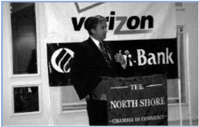
Keynote Speaker Congressman Tierney stressed the importance of workforce development and job retraining programs as one of the points in his powerful address to the Expo Breakfast attendees.