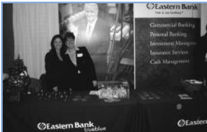
We would also like to thank our other Lead Sponsor, Eastern Bank for helping to make this year's Expo the best to-date!